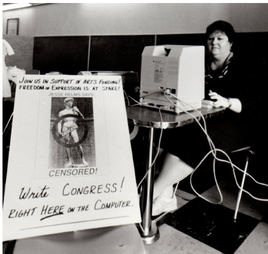
PFAW engaged activists in support for the NEA, generating tens of thousands of calls to members of Congress.

1998: People For organizes "Quiet Walk for the First Amendment" in response to protests led by the Catholic League's Bill Donohue and threats of violence directed against production of the play "Corpus Christi." Among those participating were Norman Lear , playwright Tony Kushner , and actor and writer Wallace Shawn .